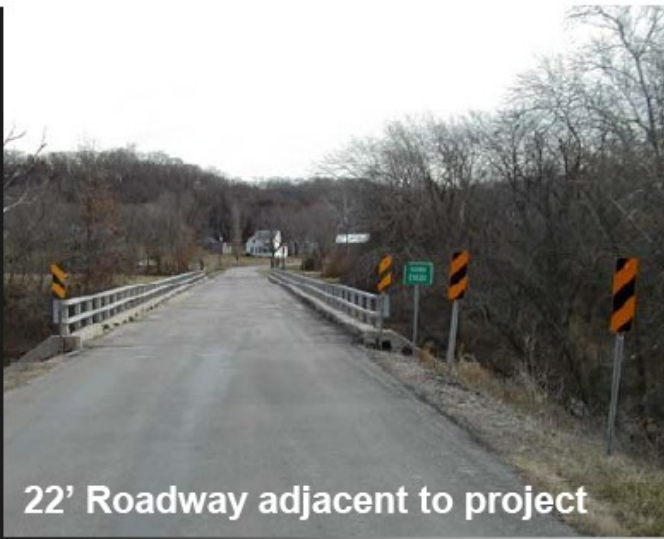
22' Roadway adjacent to project

Original Estimate: $1.8 M Redesign: $0.5 M Savings: 72% $1.3 M