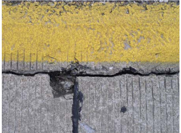
(4) Joint after being cleaned out