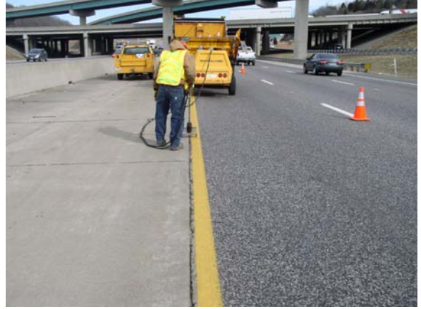
(2) Crew blowing out joints with heat & air