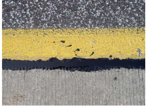
(8) Completed joints after filling: