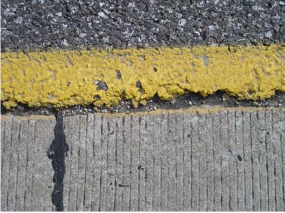
(1) Joint prior to work