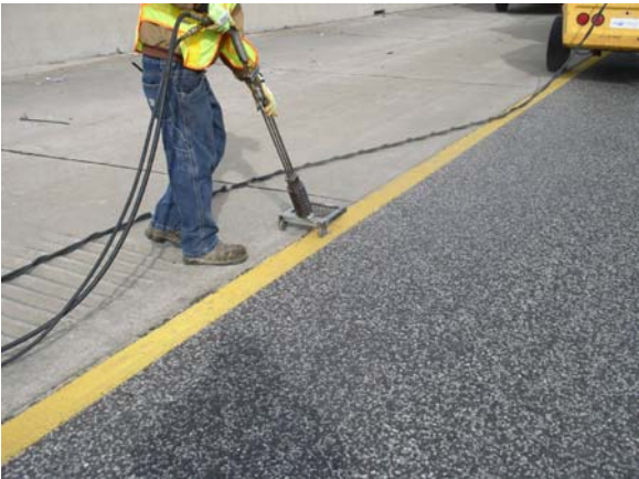
(3) Crew blowing out joints with heat & air