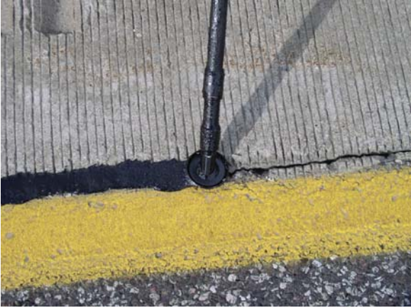
(7) Close up of wand filling the joint